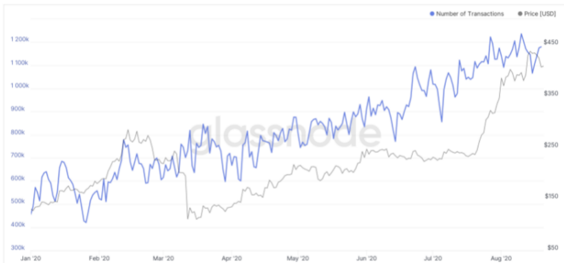
Ethereum: Number of Transactions