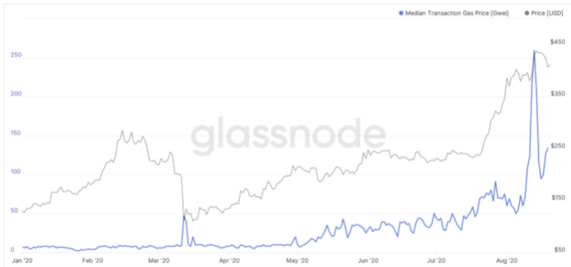
Ethereum: Median Transaction Gas Price

Ethereum VMs. TITAN Layer 2 support is more suitable for solutions that use Optimistic Rollups to take full advantage of smart contracts. Unipig has already implemented an Optimistic Rollup-based token swap solutions on the test network for trading "UNI" and "PIG" tokens with each other, and TITAN, in its work with Optimistic Rollups, will gradually implement formal network support for this on Ethereum's official network program.