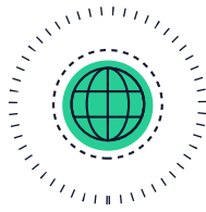
Build a global open developer platform