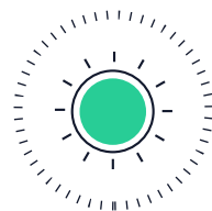
Construction of metaverse network platform, including work, social networking, games, etc.