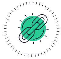
Build cross-chain interoperability protocols