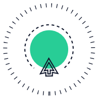
Expand performance and capacity to handle the demands for greater scale and performance