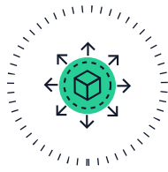
Connect the centralized and the decentralized