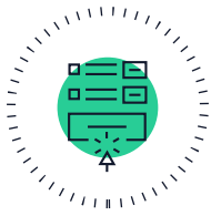
Build basic toolchain for the blockchain

The KCC chain was a blockchain project initiated and developed by the core members of the KCS and KuCoin development community. The emergence of the KCC chain started a new chapter in the development of the KCS ecosystem by bringing a lively scene of decentralized applications to the chain. KCC will focus on the following areas: