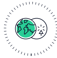
Build a decentralized autonomous community