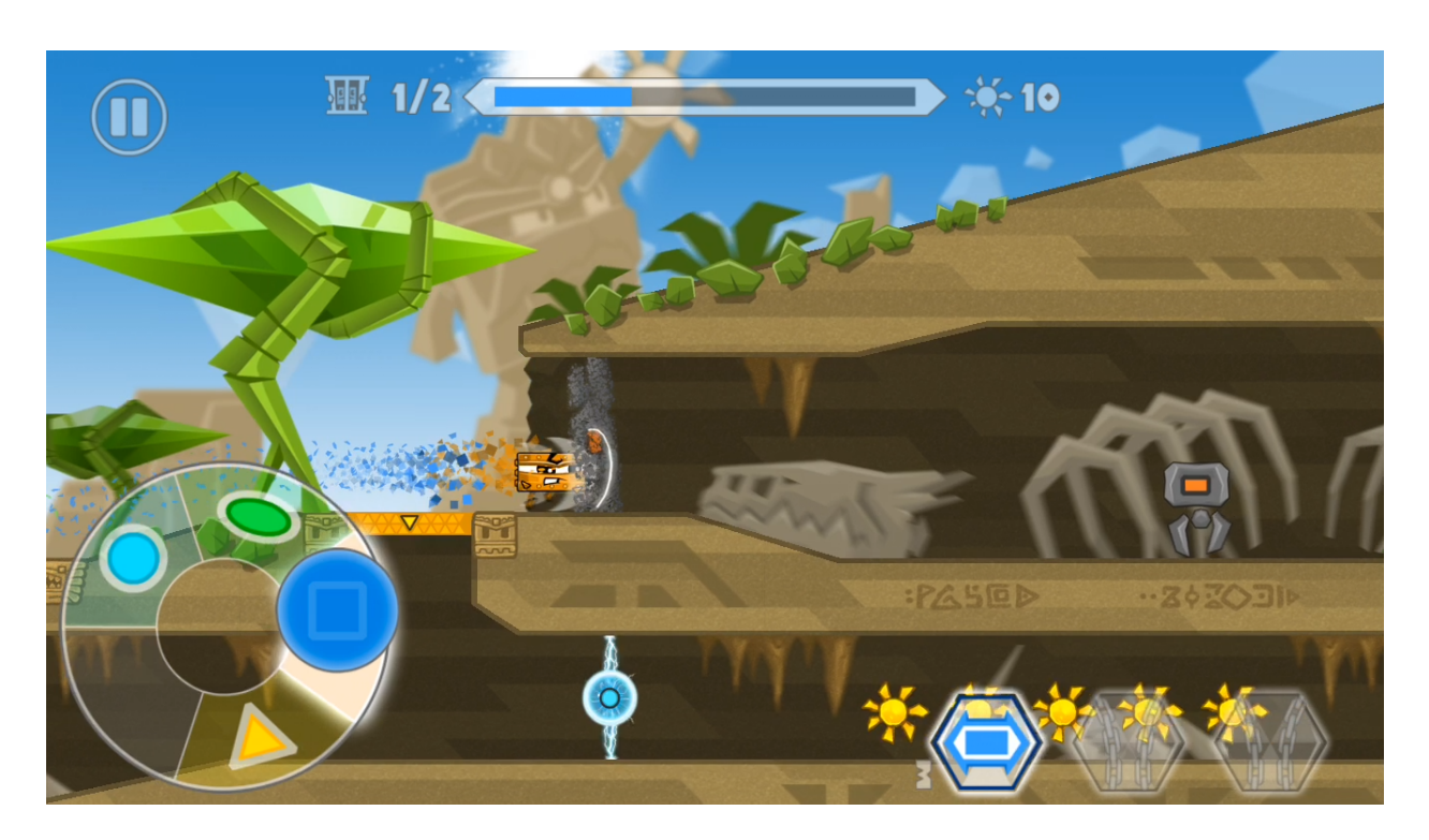
13 level (day)