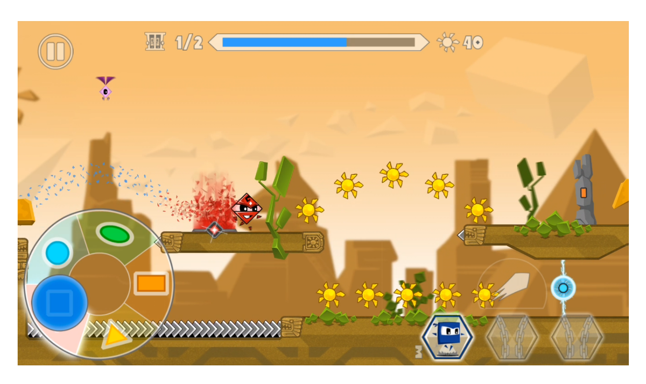
17 level (morning)