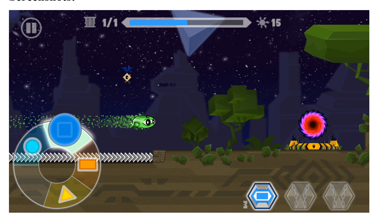
5th level (night)