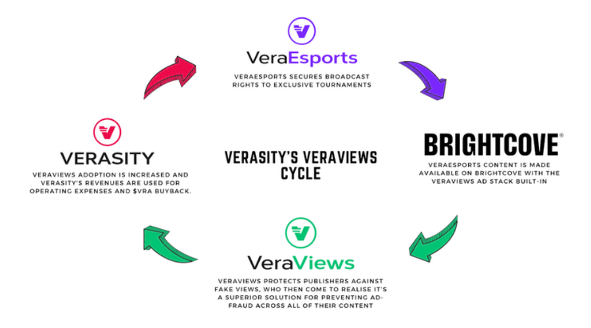
Figure 1 - Verasity's revenue cycle with Brightcove and VeraEsports content.

Verasity drives revenue through multiple avenues. Verasity makes revenues from its content streaming via VeraEsports.com with commissions on prize pools, video ad revenues and transaction fees. It also makes revenue through its integrations with third-party broadcasting marketplaces.