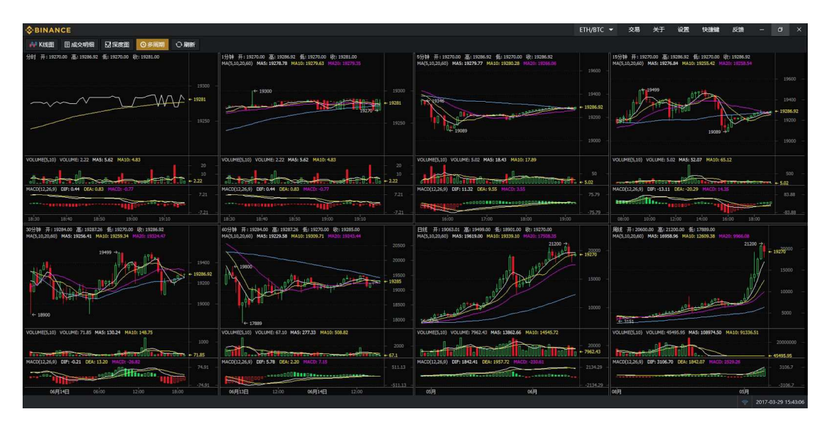
Windows PC Native Client - Multi-Interval View