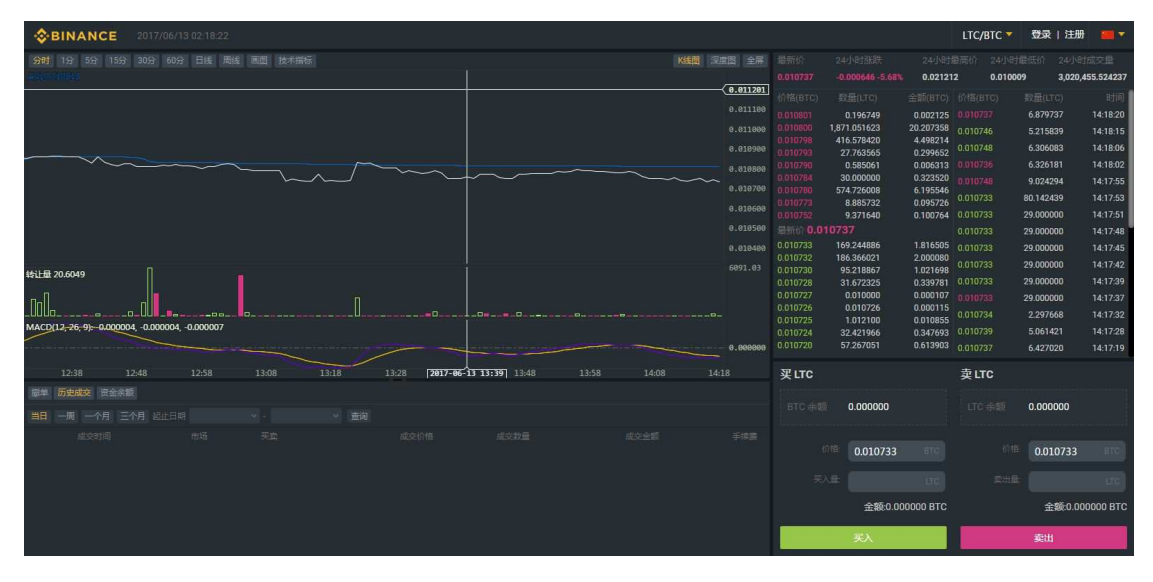
Professional Web Trading Interface