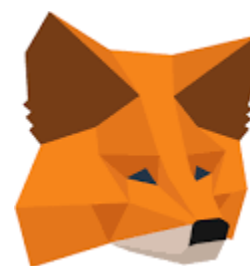
Metamask Fox Logo

You will know Metamask has been installed when you see the fox logo on the upper right hand corner of your browser.